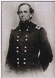
Brig. Gen. Edward Hobson, U.S.A.

Fitch's flagship was the ironclad USS Moose , USN. 1 The Moose and Fitch's dispatch privateer Imperial were tied up within earshot of the island the night before the battle. It has been written that Fitch had the boilers fired up and shooting its large cannons at the island on first rifle fire, slightly out of range before steam could make way. The USS Allegheny Belle was a little farther down tied up along the Ohio side. Having heard