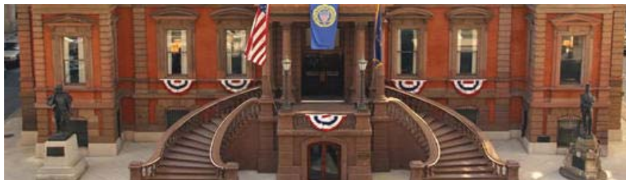
The Union League of Philadelphia, 140 South Broad Street, Philadelphia, Penn. 19102, 215-563-6500