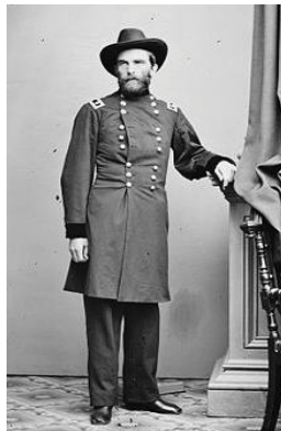
Major General Grenville M. Dodge

The Legislature took the matter in hand of my suggestion, appropriating so much money, Territorial bonds, to give the men a bounty and purchase horses to mount them on, as I have none, but the members cannot agree on the spoil, likely in their estimation to accrue from such a proceeding, so the bill has not yet passed. I addressed the speaker of the house yesterday, informing him that unless something was done within forty-eight hours I would be compelled, much against my will, to proclaim martial law and