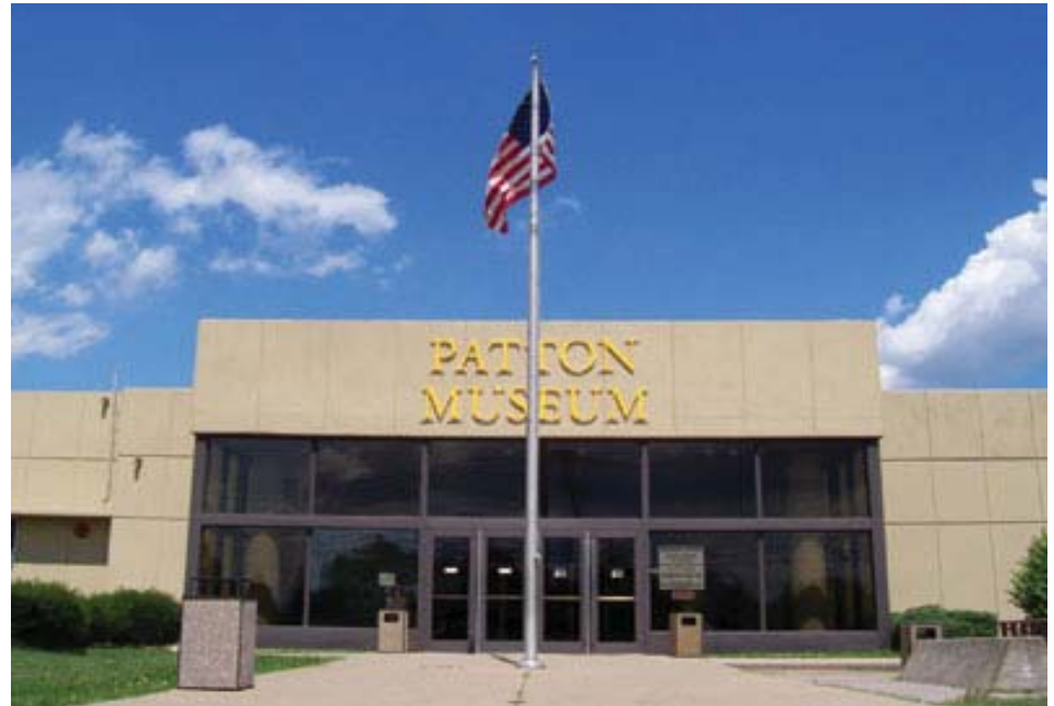
General George Patton Museum located in Fort Knox, Kentucky.

Dames, and their family members attending this year's Congress in Kentucky as a tribute to the 200th Birthday of our 16th President, Abraham Lincoln.