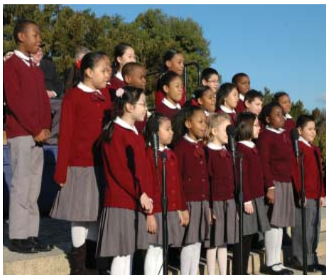
Students from Strong John Thomson Elementary School, Washington D.C. recite the Gettysburg Address.