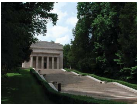
Abraham Lincoln Birthplace National Historic Site.

Registration begins at noon at the Ohio Host Committee open house. The activities will start at 2:30 PM on Friday, October 9th with a bus tour to the Abraham Lincoln Birthplace National Historical Site ( www.lincolnbirthplace.com ). The neo-classic memorial houses a 19th century log cabin