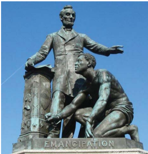
Emancipation memorial at Lincoln Park, Washington D.C.