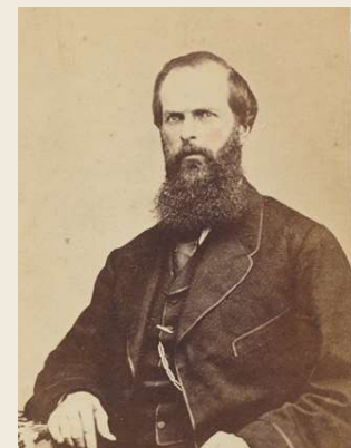
Geary as Governor of Pennsylvania, 1872.

As governor, Geary enjoyed two terms of successful administration. His policies were sound, and the state enjoyed prosperity and progress. He had reduced the public debt, increased revenues, and created a