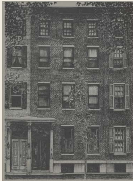
The former Civil War Library and Museum, located at 1805 Pine Street in Philadelphia.

The focus of the CWMP became the preservation and display of the treasures accumulated by the Loyal Legion and displayed for many years at 1805 Pine Street. The primary goal became securing partners with ability to manage, maintain, preserve and display these priceless treasures. The result of these efforts became a fortuitous partnership with the Gettysburg Foundation and the National Constitution Center (NCC) in Philadelphia. The agreement provides for the preservation of the artifacts at the state-of-the-art facilities of the National Park Service at Gettysburg with the Visitor Center Museum incorporating the items into its displays. The NCC has committed