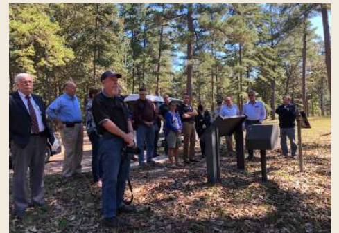
Congress attendees tour Cold Harbor Battlefield.