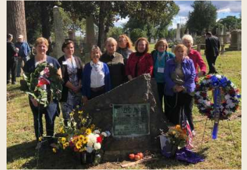
DOLLUS members gather to remember the patriotic contributions of Elizabeth Van Lew.