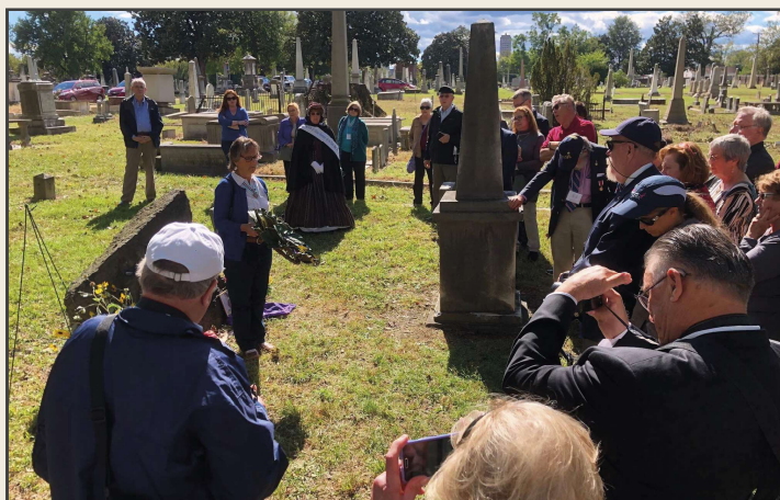
Members of MOLLUS and DOLLUS pay homage at the grave of Elizabeth Van Lew in Richmond's historic Shockoe Hill Cemetery.