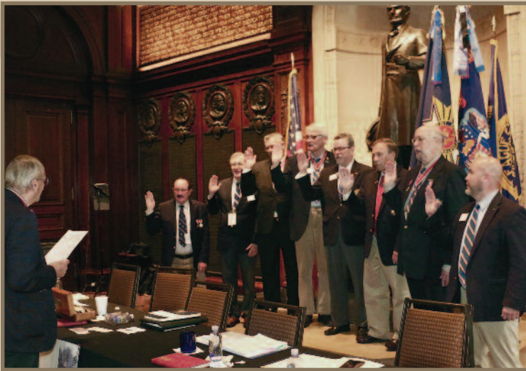
Investiture of MOLLUS Officers