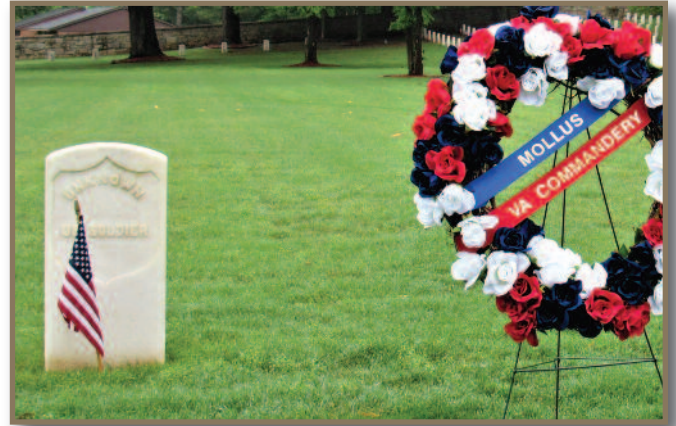
Placing wreath at Unknowns Salisbury National Cemetery