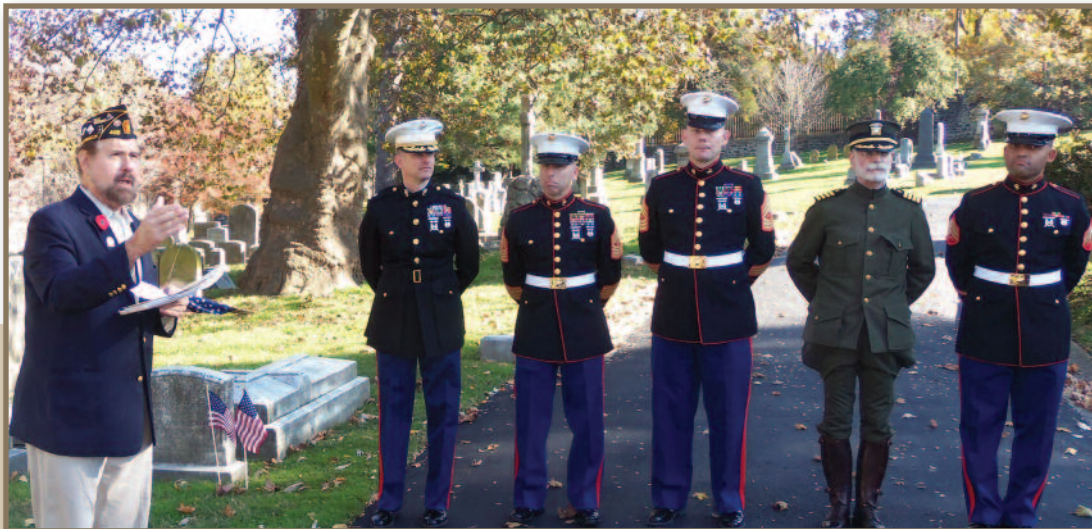
Marine Corps 246th Birthday Celebration Laurel Hill Cemetery