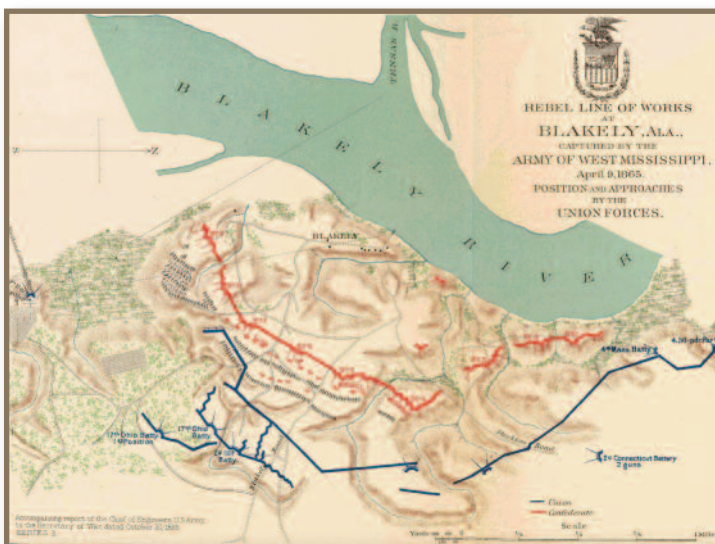
Vifquain and the 97th Illinois captured Redoubt "No. 4", shown on the map (left).