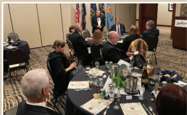
Congress Banquet Participants