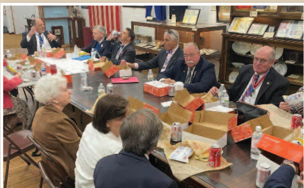
Box Lunches served at GAR Hall and Museum